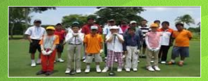
Junior Fun Golf Day, 10th March