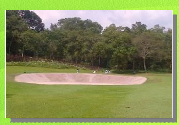
Up Lift Green side bunker Hole #3