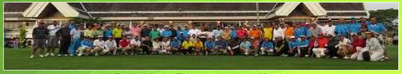
Explorationist Tournament, 29th March