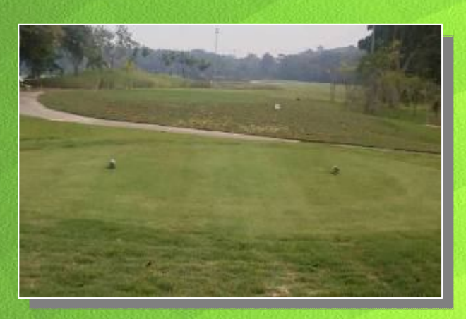
Enlarge Tee Box Hole 15 and returf with zoysia

Originally tee box hole #15 was small, 7m x 5m overgrown with cowgrass and at the same level with buggy track. Golfers from the tee ground was not able to have a clear view of the fairway. Upon uplifting and widening it, it is now double the original size, cow grass replaced with zoysia. Golfers now have commanding view.