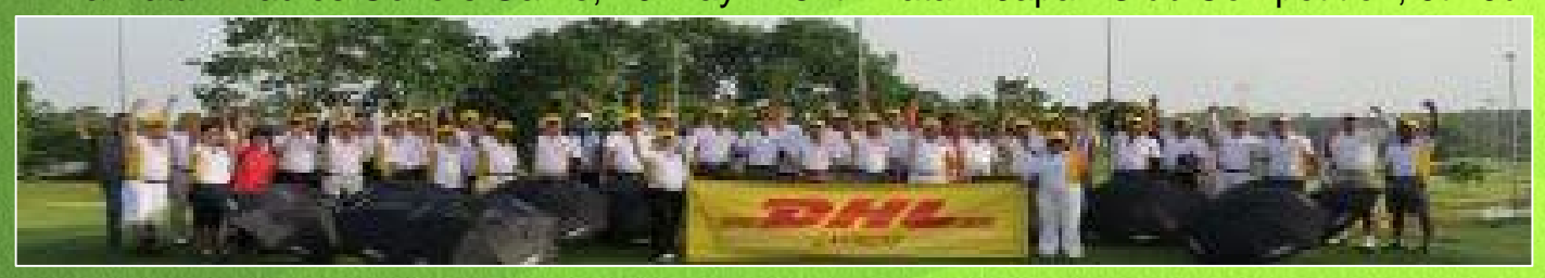
DHL Fun Golf Competition, 9th June