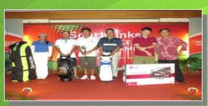
The Winner of Grand Lucky Draw