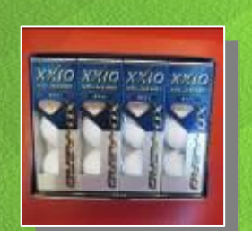
XXIO Aero Ball