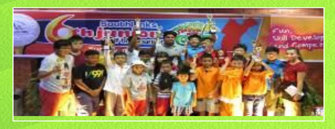
SouthLinks 6th Junior Tournament, 9th June