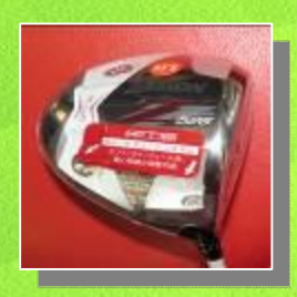
Srixon Wood Z525