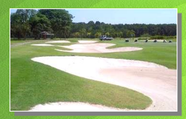
Repair & Uplift Bunkers at Hole #12